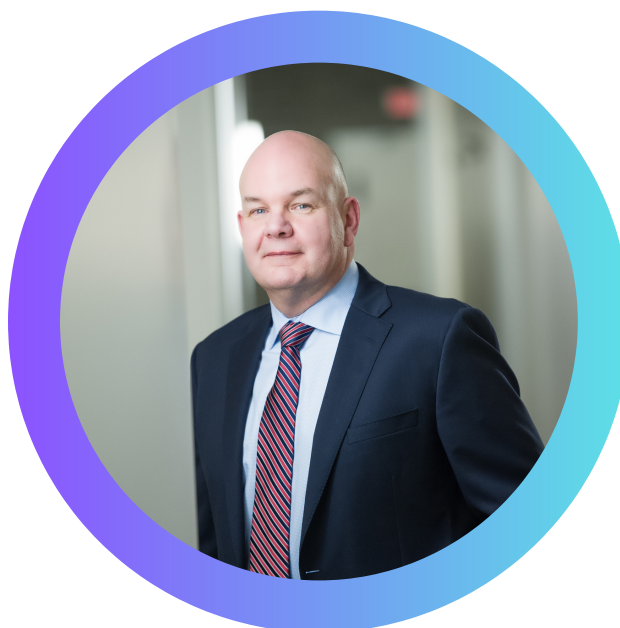
HON. FRED HORNE HEALTH POLICY ADVISOR