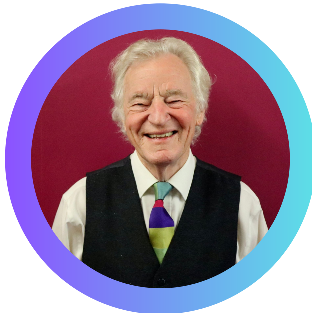
SIR MUIR GRAY OXFORD VALUE & STEWARDSHIP PROGRAM